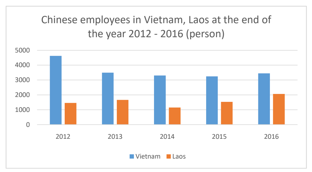
Chart 5: Chinese employees in Vietnam, Laos at the end of the year 2012 – 2016 (person)

In Laos, turnover of completed forein contracted projects increasing lead to the increasing of the contractors from 2012 to 2014. In 2012, there is 1905.23 million USD of turnover of completed forein contracted project and 8715 contractors. To 2014, there is 2327.73 million USD and 13664 contractors. But in 2015, the situation changed. There is 3216.06 million USD of turnover of completed forein contracted project but the number of contractors decreased to 10247 contractors. In 2016, it returned back to the period 2012 – 2014. There is 2947.39 million USD and 9248 contractors.