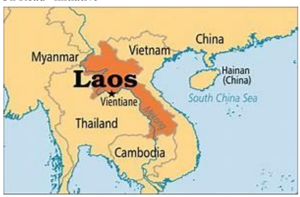
Firgue 1: China, Laos, Vietnam

Vietnam is a developing economy in the Southeast Asia. The nation is near China to the north, Laos to the northwest, Cambodia to the southwest, Thailand across the Gulf of Thailand to the southwest, and the Philippines, Malaysia and Indonesia across the South China Sea to the east and southeast. The culture of Vietnam is influenced from China, India and Western cultures, most notably France and the United States.