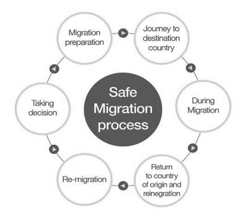
Figure 1: Safe Migration Process

it is called internal migration and when people migrate from their country of origin to another country is called overseas or international migration. The present study is about the second type of migration. People may migrate for social, economic, political or environmental cause. There are some factors behind migration namely push factors and pull factors. Push factors encourages people to leave the place where they live as such poverty, unemployment, natural disaster etc. On the other hand pull factors attract people to move another place such as better living standard, employment opportunity etc. When a migrant worker migrates to another country safely, works there for certain time period and come back to his/her country of origin by ensuring a better and sustainable livelihood is called Safe Migration. Safe migration is a step by step process including taking decision to migrate, migration preparation, journey to destination country, during migration, return to country of origin and reintegration. All these steps can be categorized into three phase's namely a) pre-departure stage which includes taking decision to migrate and migration preparation b) post-arrival stage which includes journey to destination country, during migration and c) reintegration stage includes return to country of origin and reintegration as depicted the figure below: