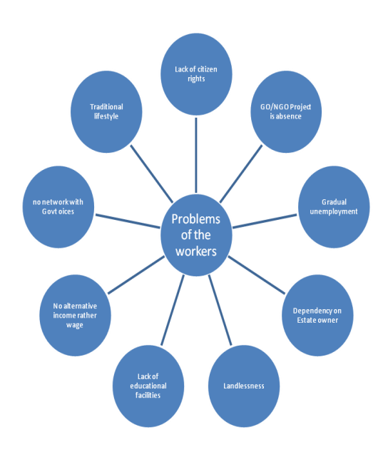
Figure-2: Problems of the Tea Workers

rice for twice meals; ii) majority of the workers survive below the poverty line. About 85% workers posses single set of dress; iii) as the parents are illiterate so there are no favorable surroundings for child education. Along with this reluctance from the garden authority bridge the barrier in terms of education; iv) water and sanitation system is very much deplorable and unhygienic. Lack of health consciousness and education, diarrhea and dysentery is the common reality in their daily lives; v) the daily wages of Tk. 31.25 and 3.5 kg of atta (wheat flour) in the weekend make their live very much shocking economically; vi) as the workers have no savings so they have no capital. As a result they cannot escape from the poverty cycle; and vii) Unemployment is the acute problem in their social life. The following figure-2 shows the problems of the tea workers and the process have been identified from studying the Gauro community.